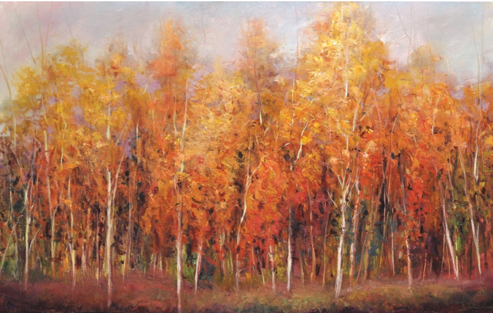
MOUNTAIN COTTONWOODS, OIL ON CANVAS, 24 X 48"