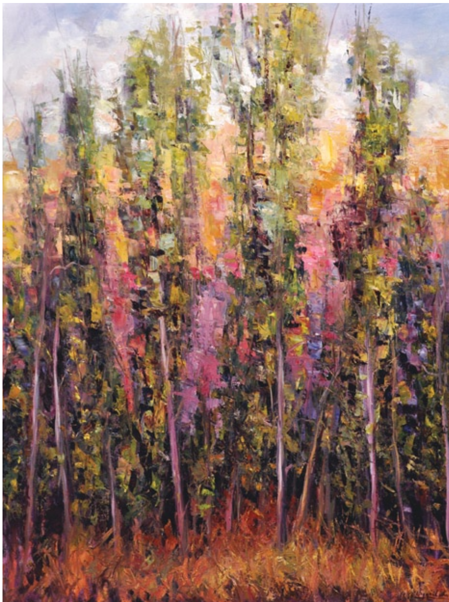
CANYON POPLARS III, OIL ON CANVAS, 40 X 30"

"For me, painting is essentially a healing practice," says Higginbotham. "I take from the raw material of landscape and, ultimately, attempt to create healing images. And they're not all meant to be serene and quiet; I also